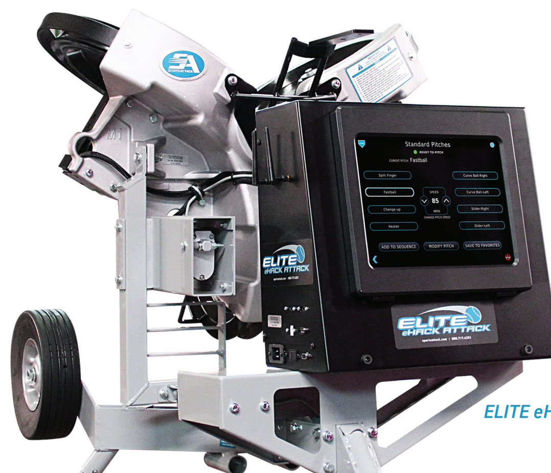
ELITE eHack Attack

A sequence of pitches (24 sequences, 12 pitches each) can be quickly saved and accessed on your favorite sequences screen so you can challenge the mechanics of any hitter or replicate a specific pitcher. These are just a few examples...visit sportsattack.com for more features on the Elite, our newest automated pitching machine.