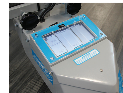
Advanced Software Program Use the touchscreen to modify any pitch by making finite adjustments to each motor individually